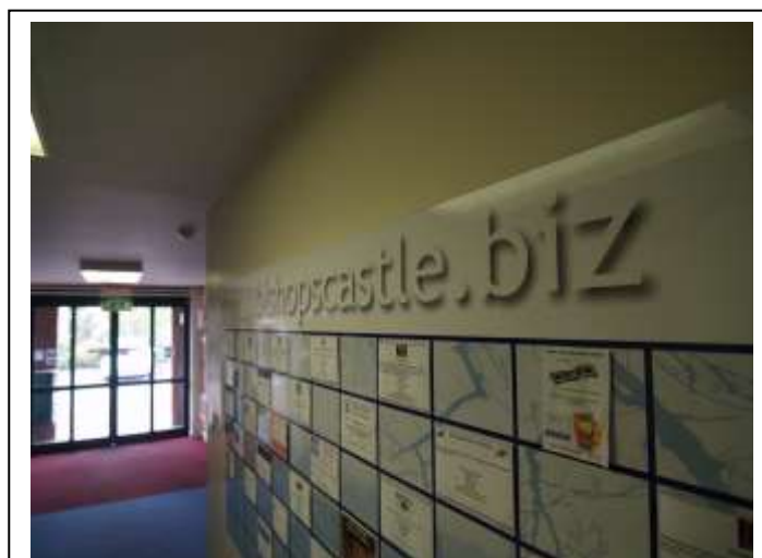
The Business Network Notice Board in the lobby

ESWS continues to manage the local Business Network with quarterly meetings, the searchable web site and our lobby notice boards. The membership has increased to 130 businesses to whom we sent over 100 emails pertinent to business support matters as well as our own offerings. We continue to represent the business community on the Shropshire Board of Affiliated Chambers. The Network website is in the process of a major overhaul and we plan to mail out a paper directory to the SY9 and SY7 postal areas.