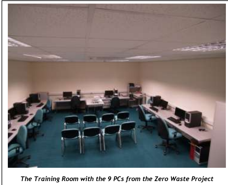
The Training Room with the 9 PCs from the Zero Waste Project

We continue to run a range of training opportunities both paid for and free and have trained 85 people in the year; down on our target which may be due to the economic situation but may also be due to our success in training new users in the previous years. We will look to diversify next year.