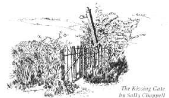
The Kissing Gate by Sally Chappell

Follow instructions for Walk 2a to point (45). Do not turn right but continue straight ahead following Shropshire Way through gate in front and along track. Go on through the next gate at the junction (50) and over the next stile (51). Carry on over stiles (52) and (53). Now head straight on down the hill towards the gate/stile in front (54). Do not pass through the gate but turn right leaving the Shropshire Way, keeping brook on left. Continue over stiles (55) and (56) and on across the next field. Go across the gated bridge (25) and turn right alongside the hedge until you find a gate at the bottom of Cwmmawr Dingle Wood (26). Now follow the instructions from Walk 1a point (26).