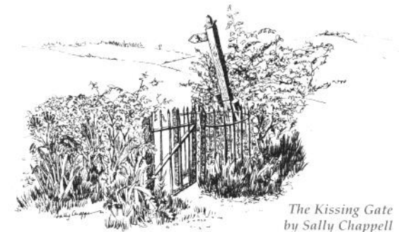
The Kissing Gate by Sally Chappell

Follow instructions for Walk 2a to point (45). Do not turn right but continue straight ahead following Shropshire Way through gate in front and along track. Go on through the next gate at the junction (50) and over the next stile (51). Carry on over stiles (52) and (53). Now head straight on down the hill towards the gate/stile in front (54). Do not pass through the gate but turn right leaving the Shropshire Way, keeping brook on left. Continue over stiles (55) and (56) and on across the next field. Go across the gated bridge (25) and turn right alongside the hedge until you find a gate at the bottom of Cwmmawr Dingle Wood (26). Now follow the instructions from Walk 1a point (26).