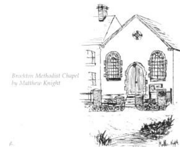
Brockton Methodist Chapel by Matthew Knight

Now follow the instructions from Walk 1 point (22) to return to Bishop's Castle on the Shropshire Way.